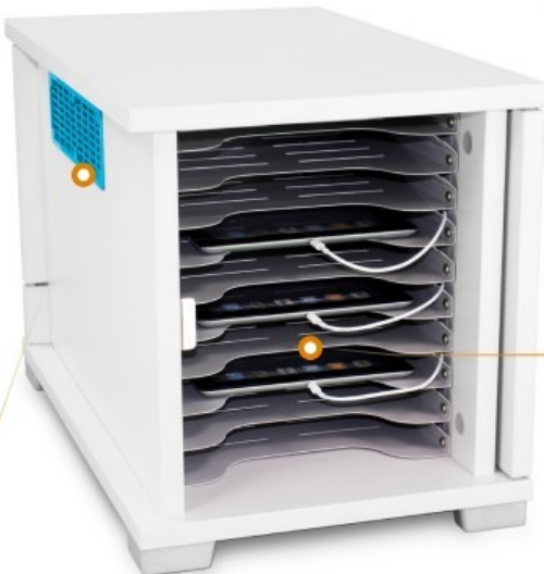
1.6mm grey steel fixed shelves with ventilations.