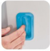
Inset door handles.