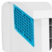
Well placed vents to the rear and base.