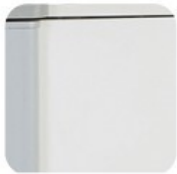
Strong MFC cladding.