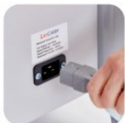
IEC power cable into the mains.