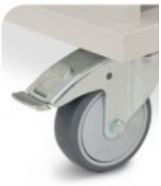
Non-marking hospital grade rubber wheels.