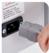
IEC power cable into the mains.