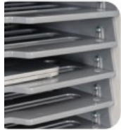
Fixed plastic shelves with ventilations.