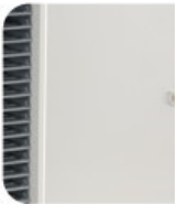
Large doors open wide.