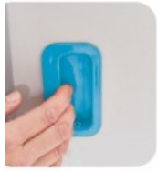
Inset door handles.