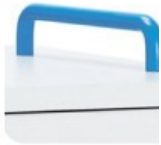
Easy grip handles make it easy to manoeuvre.