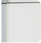
Strong MFC cladding.