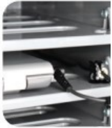
Clips to keep cables in place and free from damage.