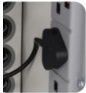
Device adapters plug into 4x8-way powerstrips.