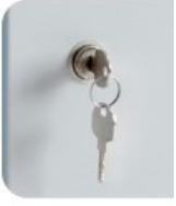
Lock supplied with 6 plate lever activation system.