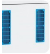
Well placed air vents to the rear and base.